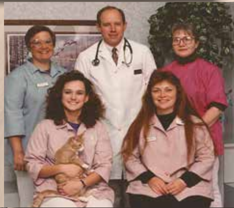
1988 First RRAH team. We've come a long way in 25 years.

Medicine is safer, more effective Remember when protecting your pet against heartworm was a daily pill? Now, it is a convenient, easy-to-use monthly chewable tablet that protects against heartworm and other parasites. Medicines are more effective, safer than ever before.